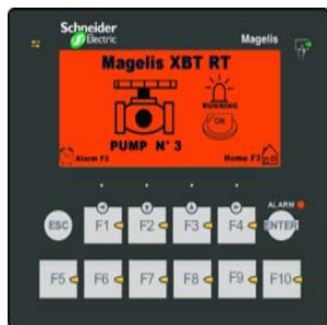
XBT R T